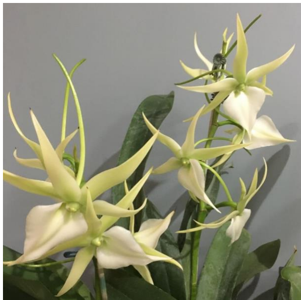
Angraecum sesquipedale x Angraecum superbum (Grown and photographed by Courtney Rogasch)