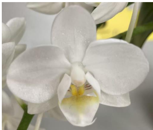
Phalaenopsis unknown (Grown by Nelia Farquharson)