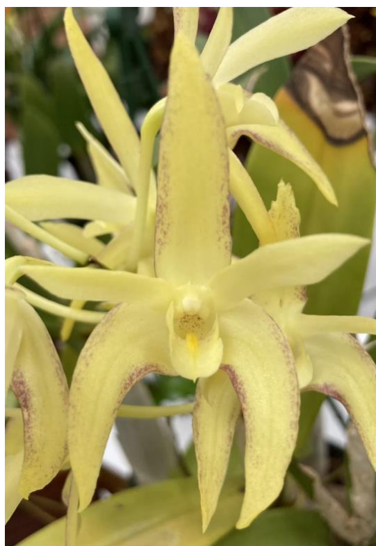
Dendrobium Jayden 'Elegant Heart' x Dendrobium speciosum (Grown by Tara Peeters)