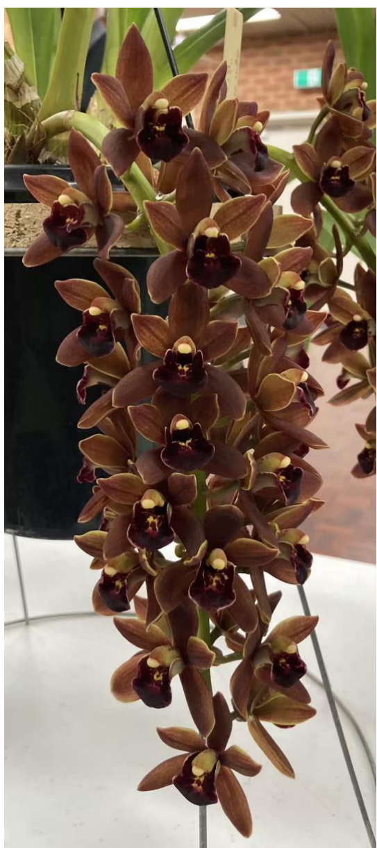
Cymbidium Heartbreak Doctor 'Bleeding Heart' (Grown by Mal Davis)