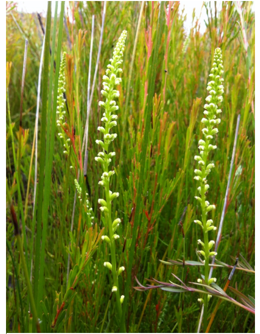
Figure 1: Microtis globula

In May this year, volunteers were searching for new peats in a recently burnt area when they stumbled across a small, but interesting orchid. The helmet orchid (Figures 2 & 3) has never been seen or recorded before and is completely new to science. This is a new species and will be monitored and more information recorded over the next few years before it gets formally named, but for the moment it is known as Corybas sp 'Peat'.