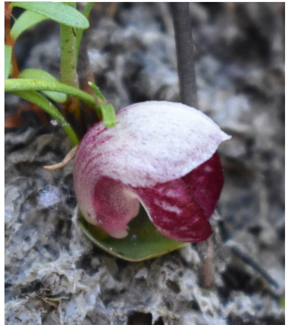
Figure 3: Corybas sp 'Peat'

The discovery of a completely new species is an amazing outcome from the Peat Project and proof that there are so many areas in the Walpole Wilderness that need to be explored with a great potential for discovery of new species.