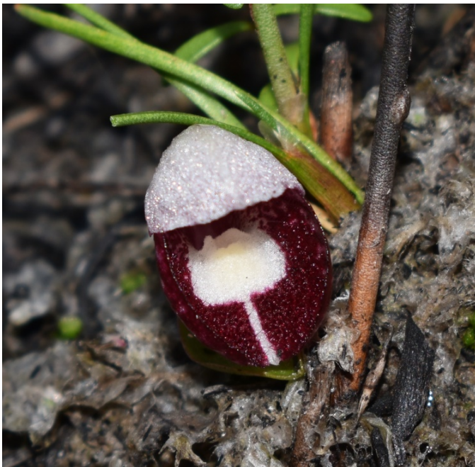
Figure 2: Corybas sp 'Peat'